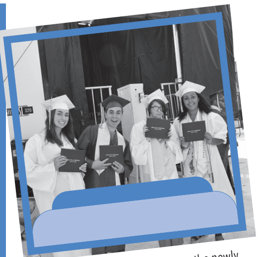
Following the graduation ceremony, the newly anointed Division Avenue alumni proudly showed off their diplomas.