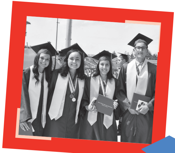
Members of the Class of 2021 are ready to begin their next adventure.