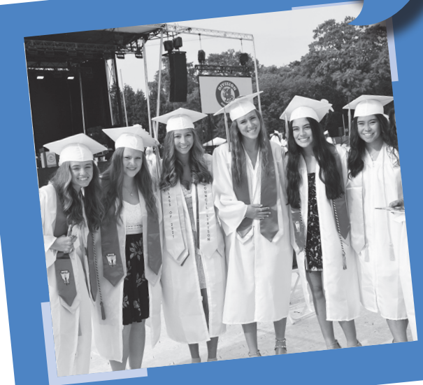
Members of the Class of 2021 are all smiles prior to the start of the graduation ceremony at Hofstra University.