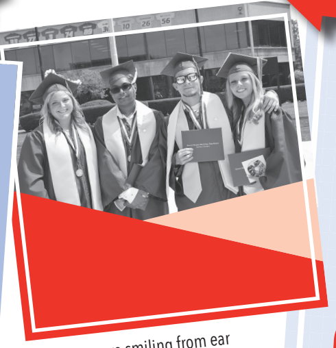
Students were smiling from ear to ear during MacArthur High School's graduation.